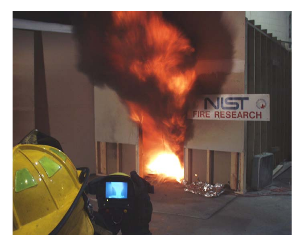
Figure 3.2 Testing the operational range of a thermal imaging camera.

have produced improvements in situational awareness for fire fighters in the form of thermal imaging and fire fighter tracking and accountability systems.