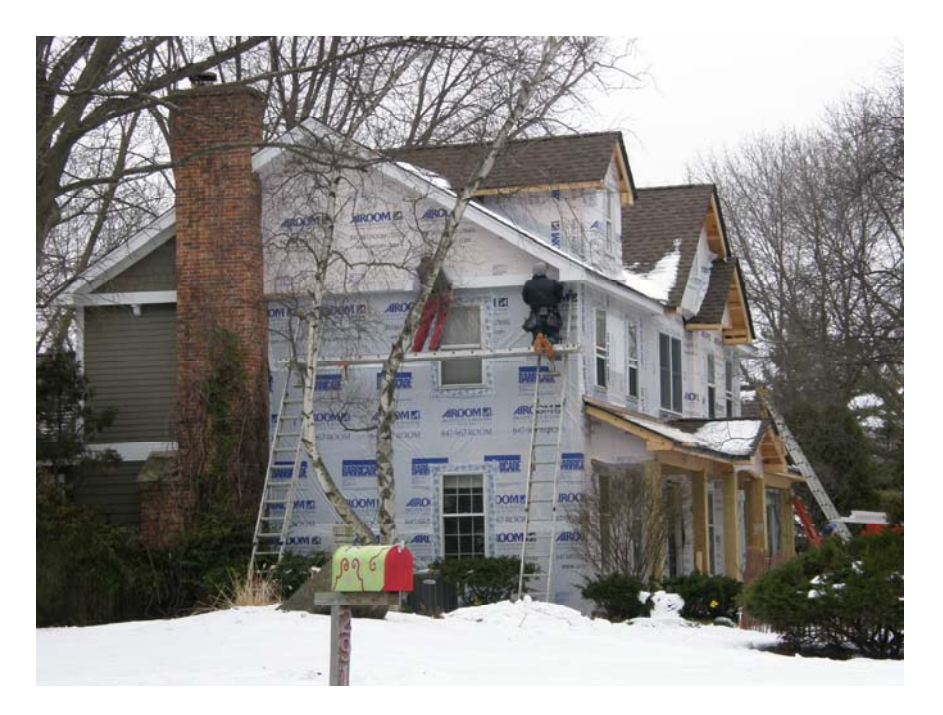
Figure 1. Modern houses use plastic sealing wrap to exclude water and multi-pane windows to improve energy efficiency.

The objects and materials inside our homes have changed as well. The information age has bought additional electronic appliances into homes and offices. Larger televisions, personal computers, cell phones, cameras, video games and battery chargers are in most homes.