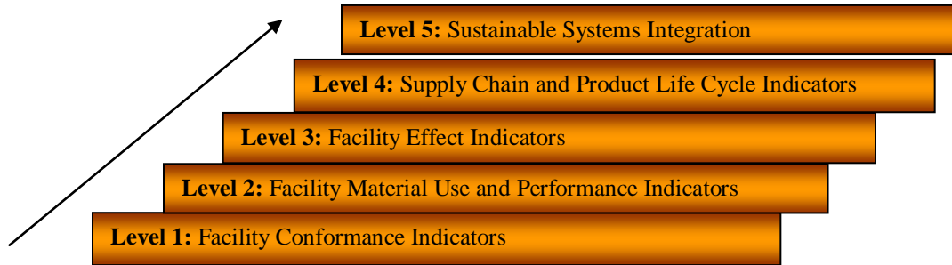
Figure 1: A model of five different stages of environmental indicators (Greiner 2001)

When starting to use indicators, it is recommendable for companies to begin with a couple of key indicators (Krajnc and Glavic 2003). The indicators should be determined so that the system boundaries and time line are clear; e.g., whether the data are for yearly or daily production. For example, LCA uses the data gathered from the whole life cycle of the product (ISO 14040 2006), and the input data are most commonly expressed per year of production and converted for the assessment per product.