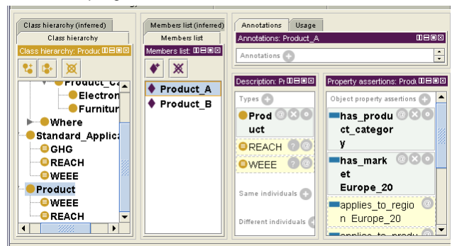
Figure 2. Inferred standards for Product A.

In summary, ontologies provide a means to not only explicity represent gaps and overlaps between sustainabitily standards, but also provide a means for identifying when these standards need to be considered. As new standards are introduced or being considered, they are able to be mapped into the existing GOO environment. In addtion, because all gaps and overlaps mappings were performed in the TBox of the ontology, new products can be continuosly introduced into the gaps and overlaps environement without disrupting it.