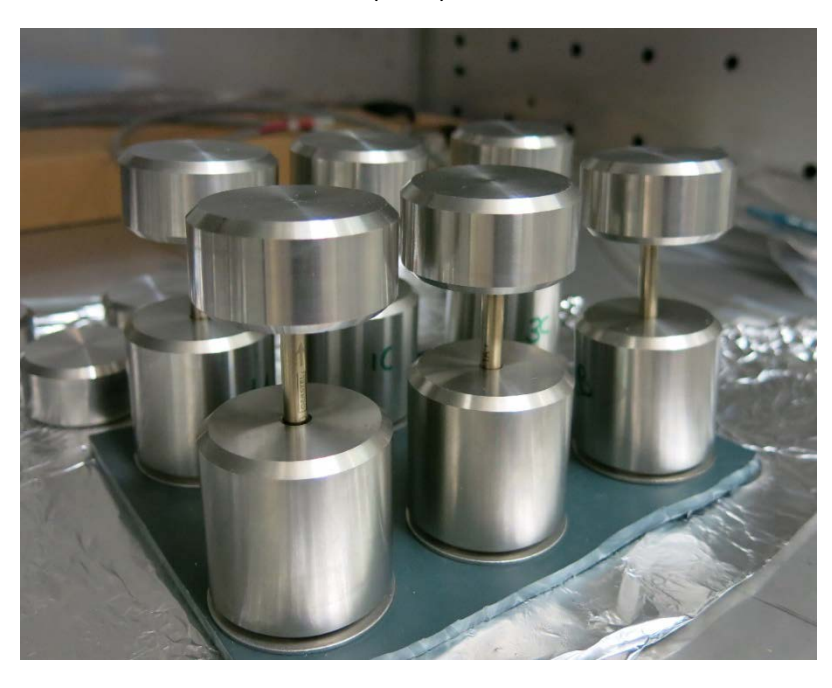
Figure 1: Sampling apparatus for passive sampling of DEHP emission from vinyl flooring.

same as that tested in Wu et al. (2016).