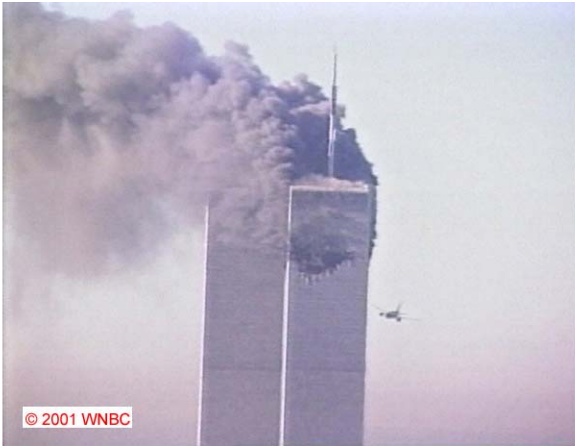
Figure A-8. Still image from Video V8 (WTC 2 impact).