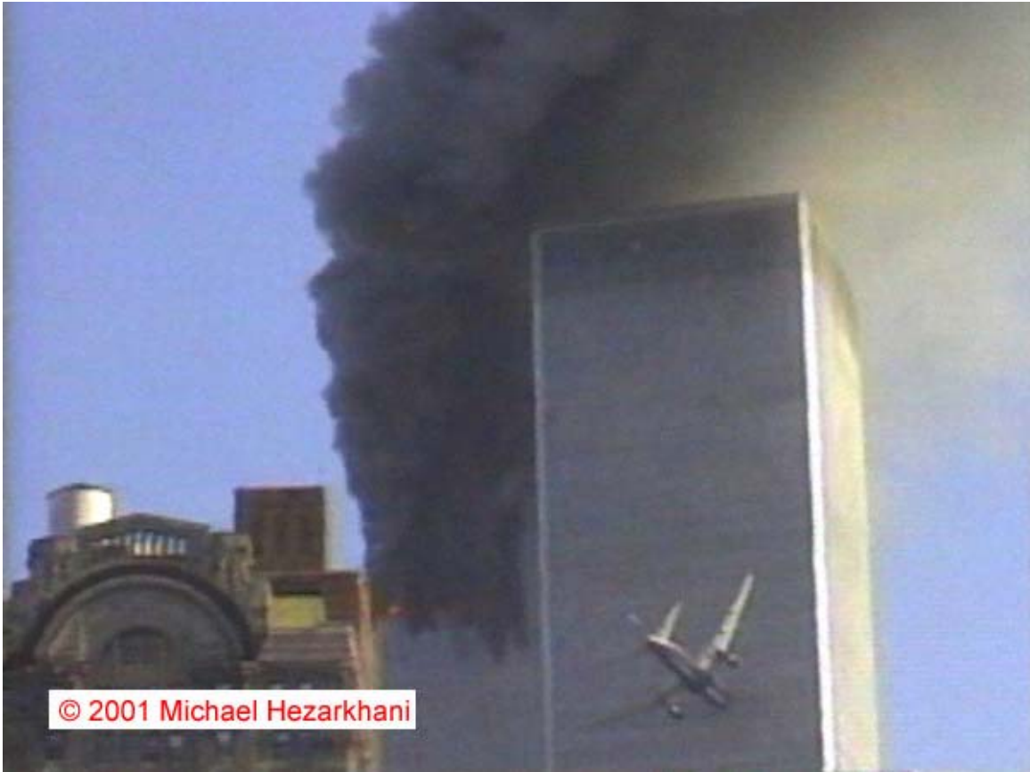
Figure A-4. Still image from Video V4 (WTC 2 impact).