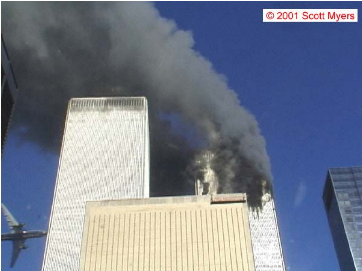
Figure A-6. Still image from Video V6 (WTC 2 impact).