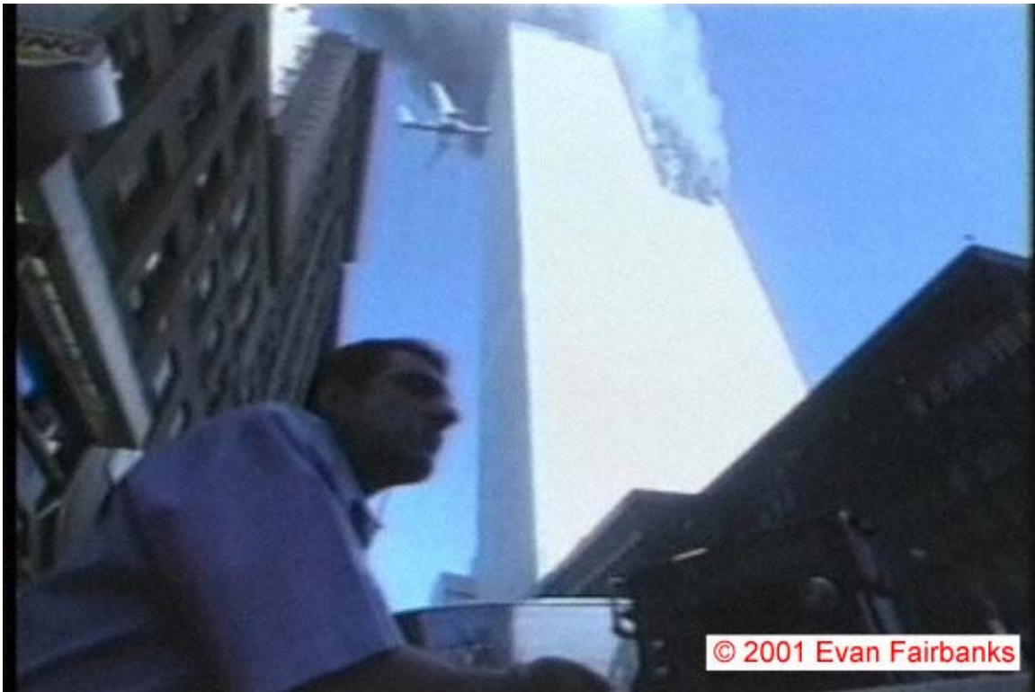
Figure A-7. Still image from Video V7 (WTC 2 impact).