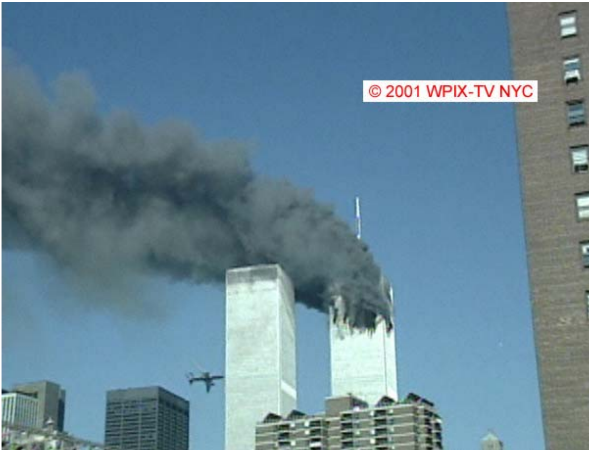
Figure A-9. Still image from Video V9 (WTC 2 impact).