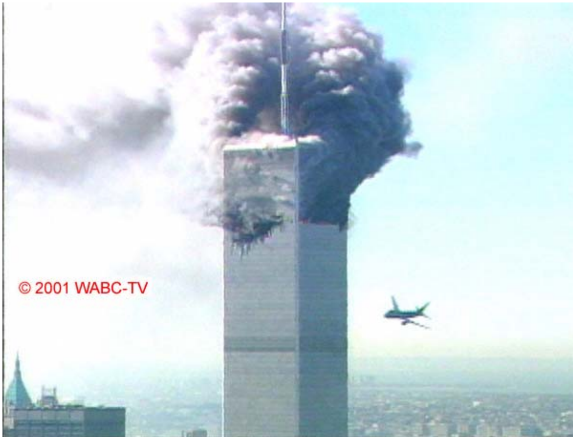
Figure A-3. Still image from Video V3 (WTC 2 impact).