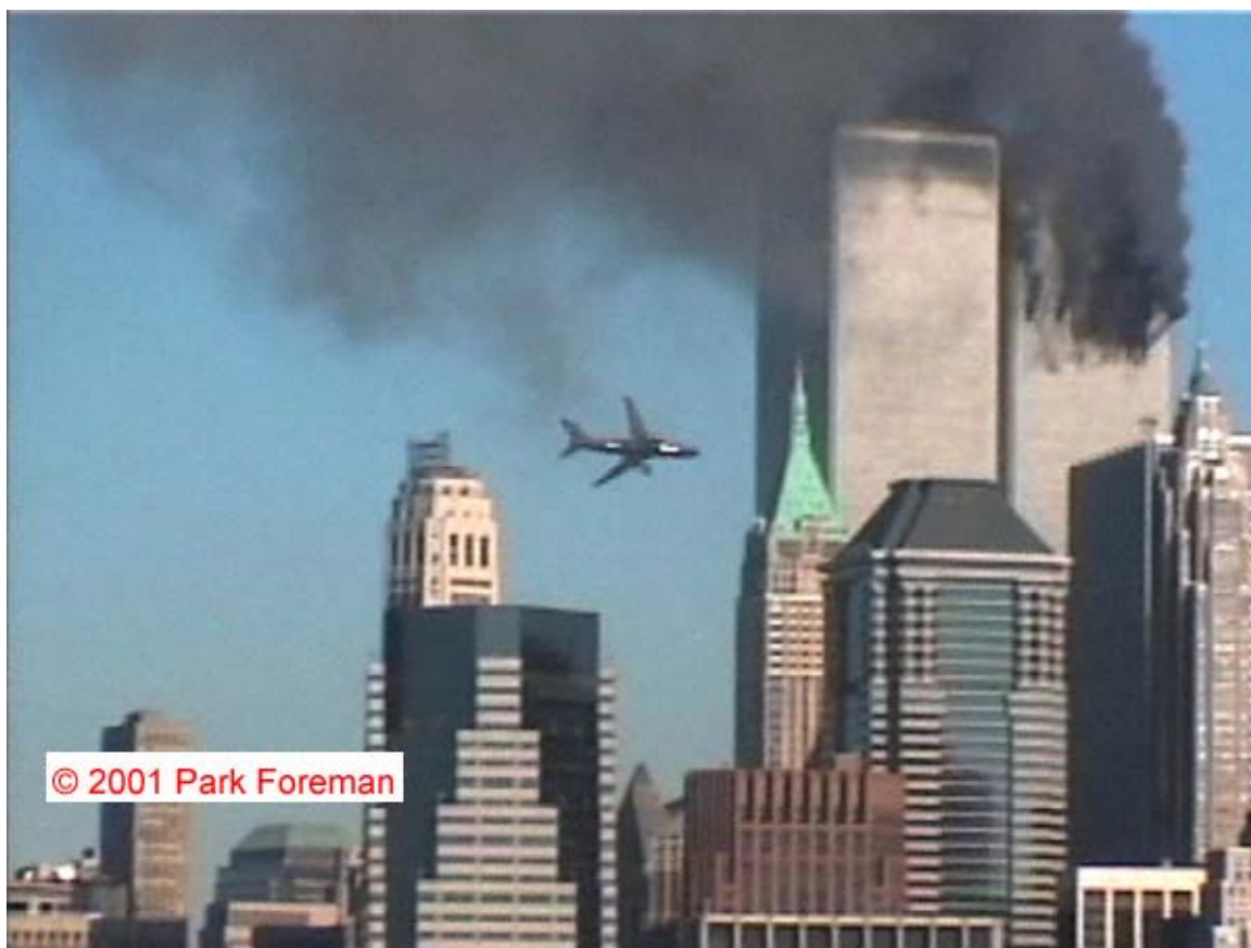
Figure A-5. Still image from Video V5 (WTC 2 impact).