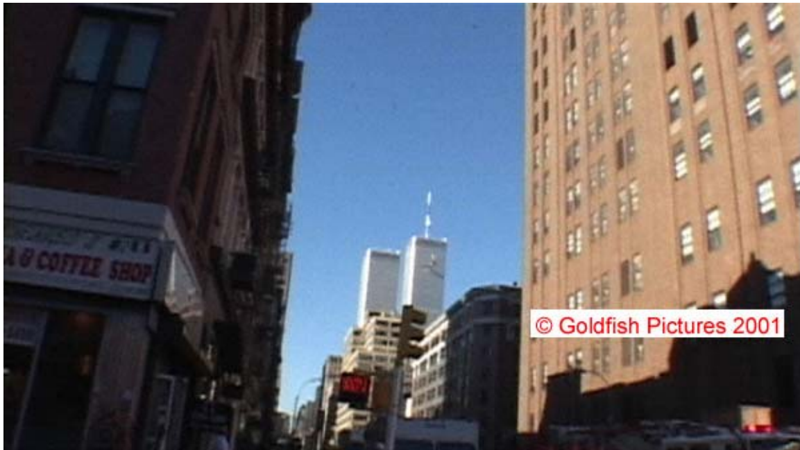
Figure A-1. Still image from Video V1 (WTC 1 impact).

This appendix provides still images of the video records used to estimate the initial impact conditions of the aircraft that impacted World Trade Center (WTC) 1 and WTC 2 (see Chapter 7). A short description of each of these videos is provided in Table 7-1.