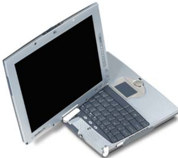
Figure A-1. Example pen tablet PC.

This pen tablet PC weighs only 3.1 pounds, has a 10.4-inch viewable screen, and comes standard with an 800 MHz CPU, 128 MB of RAM, and a 20 GB hard drive. In addition to the standard touch screen display, the latest generation of Tablet PCs includes a wireless keyboard to facilitate data entry. The Tablet PC shown in Figure 1 converts easily from a Tablet PC to a Notebook PC form factor. Our proposed instrument design using this technology is described in the following paragraphs. The instrument will be developed (i.e., programmed) to collect the fact-to-face interview data in three stages, following the steps of the combined BSIT / CIM interview process.