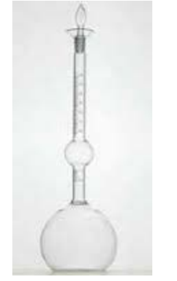
Figure 1: Le Chatelier flask [8]

To maintain stable conditions, the procedure recommends placing the flask in a constanttemperature water bath to avoid fluctuations greater than 0.2 °C between the initial and final measurements. The key measurement is reading the meniscus of the liquid at two different levels to determine the volume of liquid displacement. These readings are a source of operator error due to parallax error if the meniscus is not read correctly.